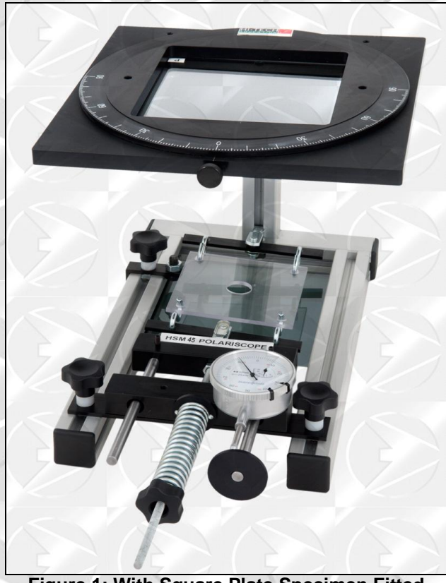
Figure 1: With Square Plate Specimen Fitted