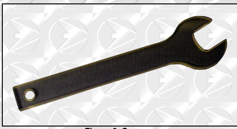
Figure 8: Spanner