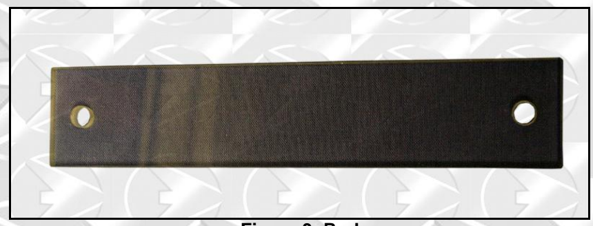
Figure 3: Rod

To expand on experiments the specimens sets HSM45a, HSM45b and HSM45c are available to order as separate non-essential accessories.