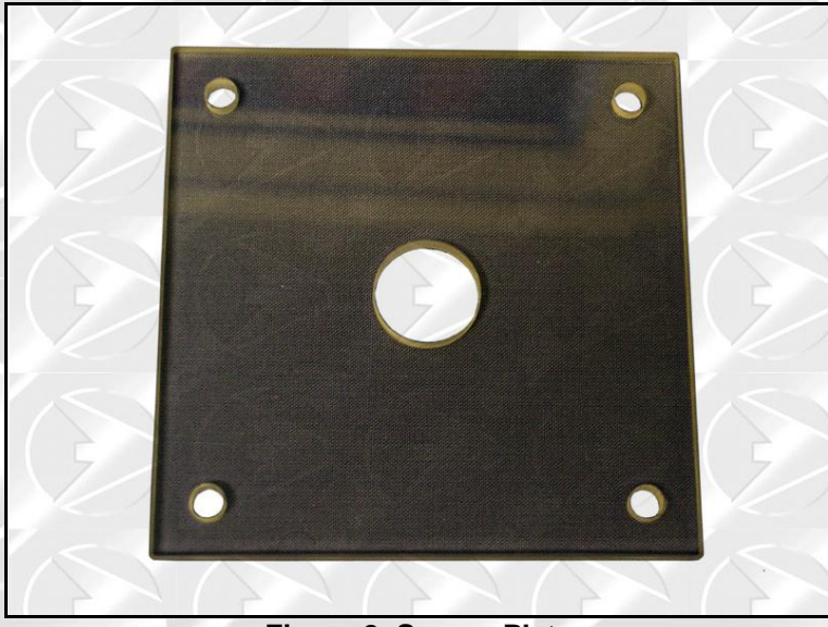
Figure 2: Square Plate

Actual Polariscope samples are clear (transparent- no colour) apart from when force is exerted through them using the loading mechanism and viewed through the filter setup with a light box/ projector underneath.