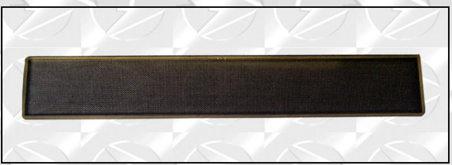
Figure 5: Bar Specimen