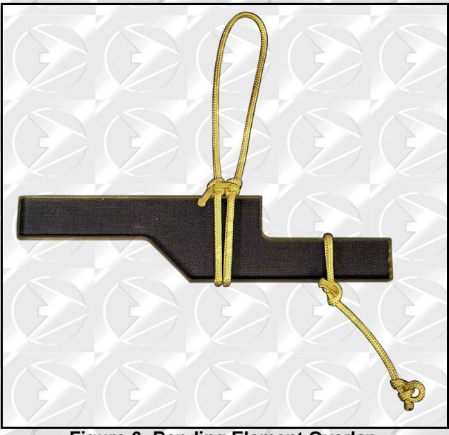
Figure 6: Bending Element Overlap