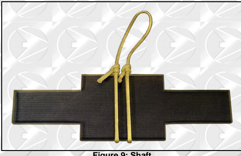
Figure 9: Shaft