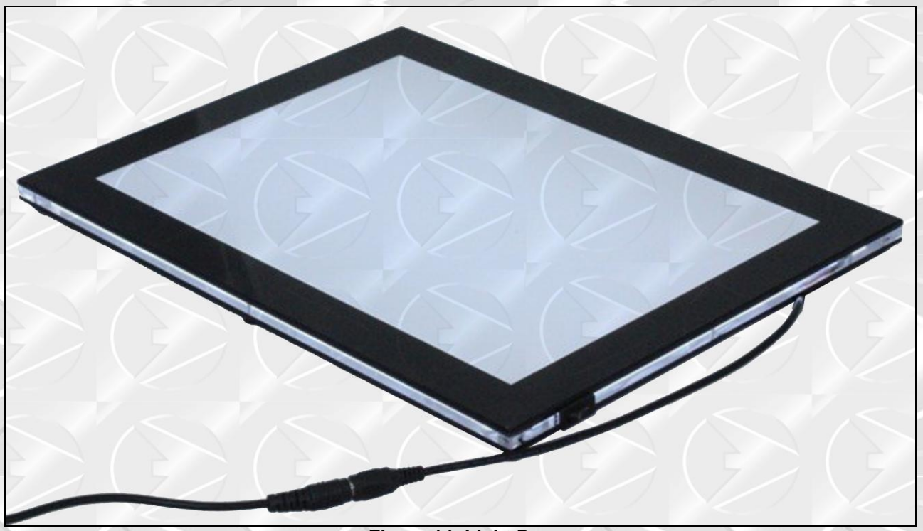
Figure 14: Light Box

Power is introduced via a universal transformer that can be powered from 100-240V mains input.