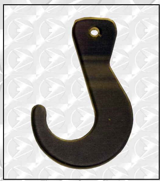
Figure 7: Crane Hook