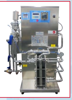
PADC Computer Controlled Teaching Autonomous Pasteurization Unit