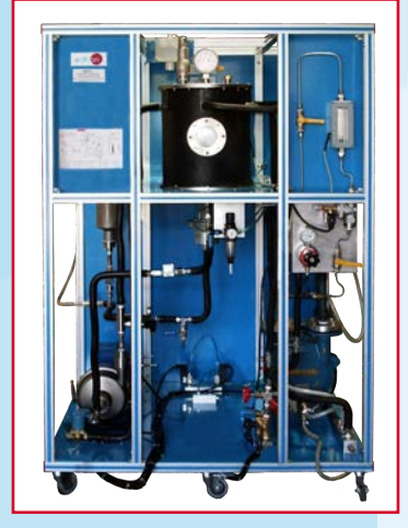
AEHC Computer Controlled Hydrogenation Unit

VPMC Computer Controlled Multipurpose Processing Vessel