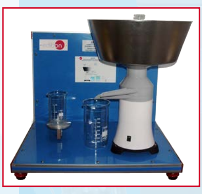
DSNC Computer Controlled Teaching Cream Separator